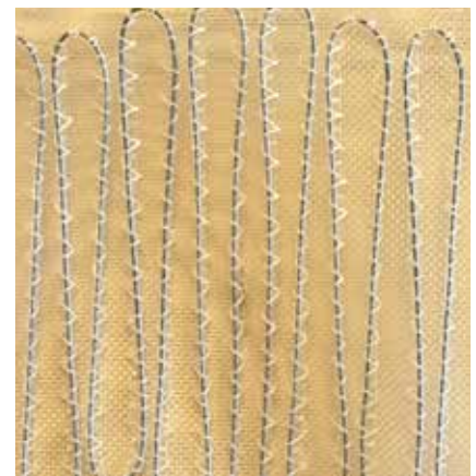
Bekiflex ® and Bekinox ® -based embroidered heating element