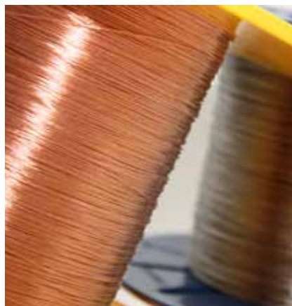
Bekiflex ® steel cable constructions