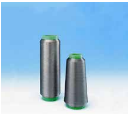
Bekinox ® VN/HT stainless steel fiber bundles

Bekaert Bekiflex ® covers a wider range of lower resistance steel cables. Depending on the alloy, we can produce filaments with a diameter of 50, 60 or 80 \mu . In this family, we use today 3 types of alloys which are represented as Bekiflex ® HR, Bekiflex ® MR and Bekiflex ® LR. With these base filaments, we can make whatever cable you need. The main difference between these families is the resistance per meter which gives you more flexibility in design and still offers a better flex-life than typical Cu-cables.